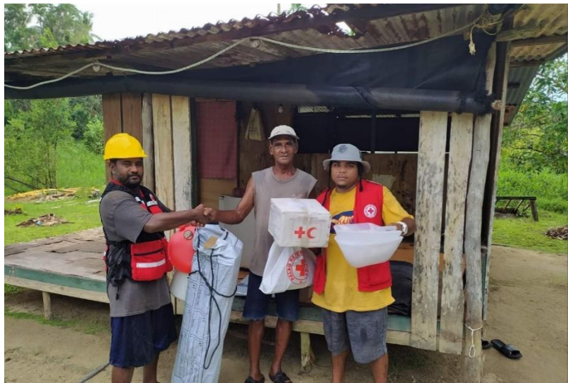
Photos Above: (Left) R-DAT distributing NFIs to a recipient in Ngchesar state. (Right) Ngiwal state staff, recipient, and PRCS logistics/distribution team posing for a photo with various NFIs.