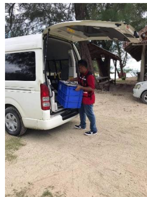
Photos Above: (Left) PRCS Logistics/Distribution team in NEMO boat, on their way to Peleliu & Angaur; (Right) PRCS distribution personnel delivering family kits in Peleliu.