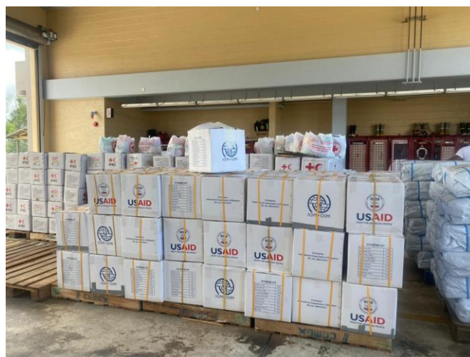
Photos above: Hygiene kits donated by International Organization for Migration (IOM) Agency in Palau.