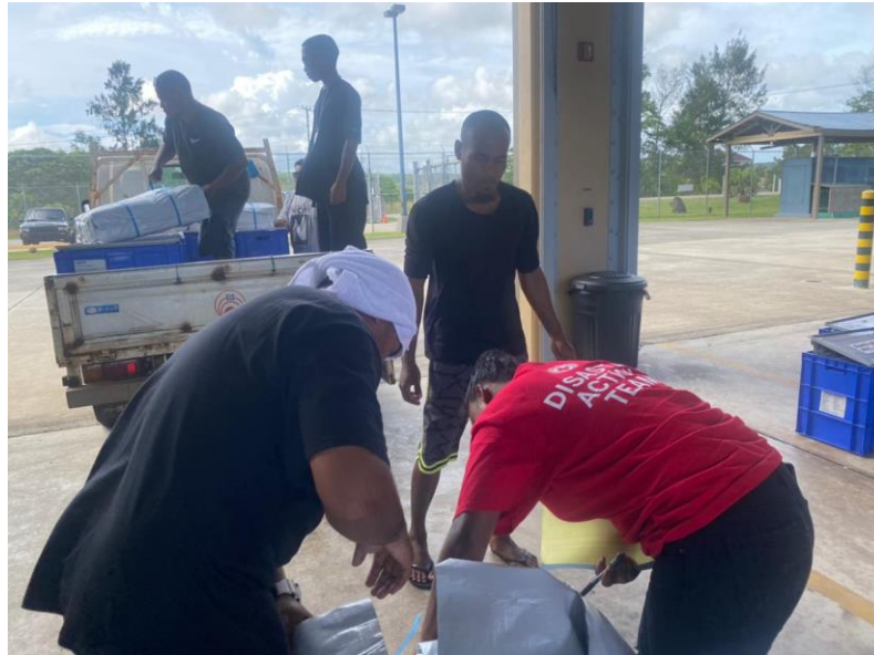
Photo Above: PRCS logistics & distribution team giving Ngarchelong state R-DATs a hand in loading NFIs unto their truck.