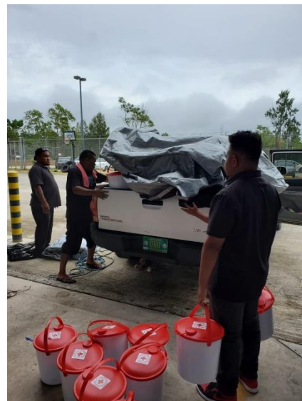
Photos above: PRCS staff and volunteers assisting Airai State R-DATs (left) and Ngatpang State R-DATs (right) in loading relief supplies into their trucks.