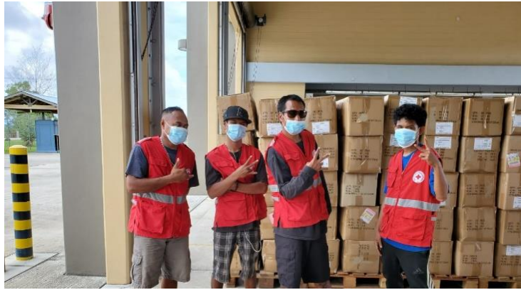
Photo above: Airai State R-DATs assisting PRCS with incoming flight carrying relief supplies.