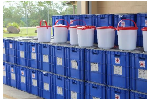
Photos above: Family kits already prepared for distribution.