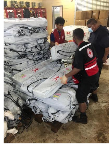
Photos above: (left to right) PRCS staff and R-DATs wearing protective masks and gloves while unloading relief supplies.