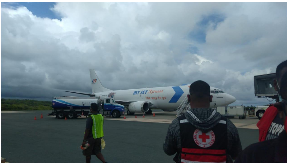
Photo above: Airplane from Malasia carrying more relief supplies for Typhoon Surigae damaged households.