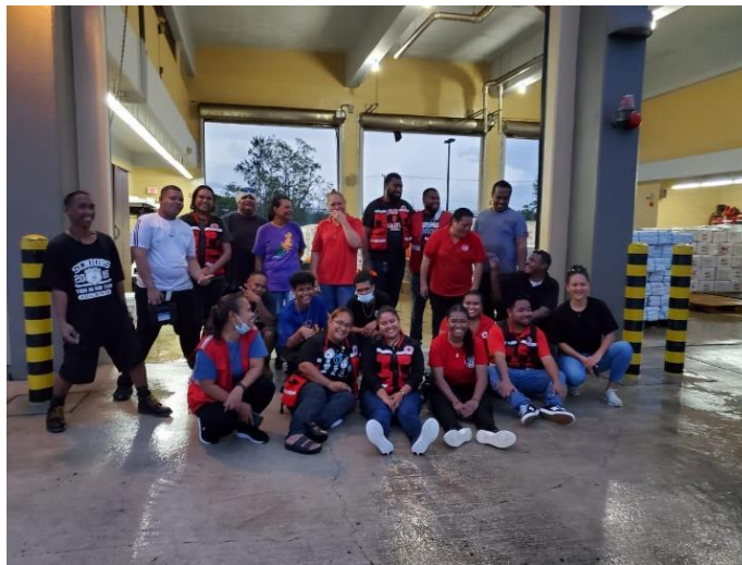
Photo above: PRCS staff, volunteers & R-DATs posing for a picture after working hard to off-load, transport, and sort relief supplies.