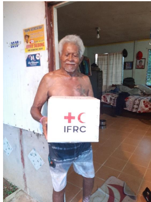
Photos Above: Aimeliik State R-DAT distributing family kits to Aimeliik state residents.